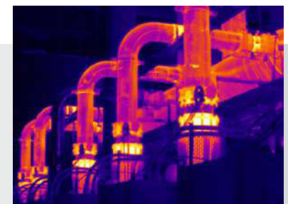
MultiSharp™ Focus, available on the Ti450.